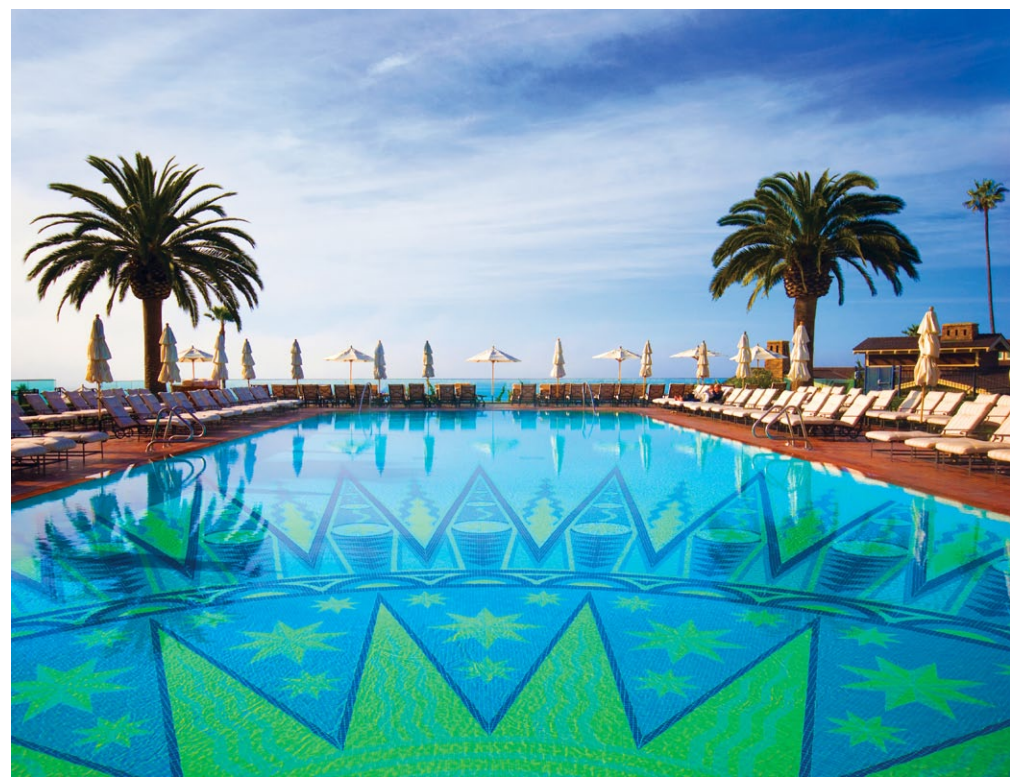
FROM TOP, CLOCKWISE: Cap Juluca, Maundays Bay, Anguilla; Montage Laguna Beach, Laguna Beach, California; Rosewood Little Dix Bay, Virgin Gorda, British Virgin Islands