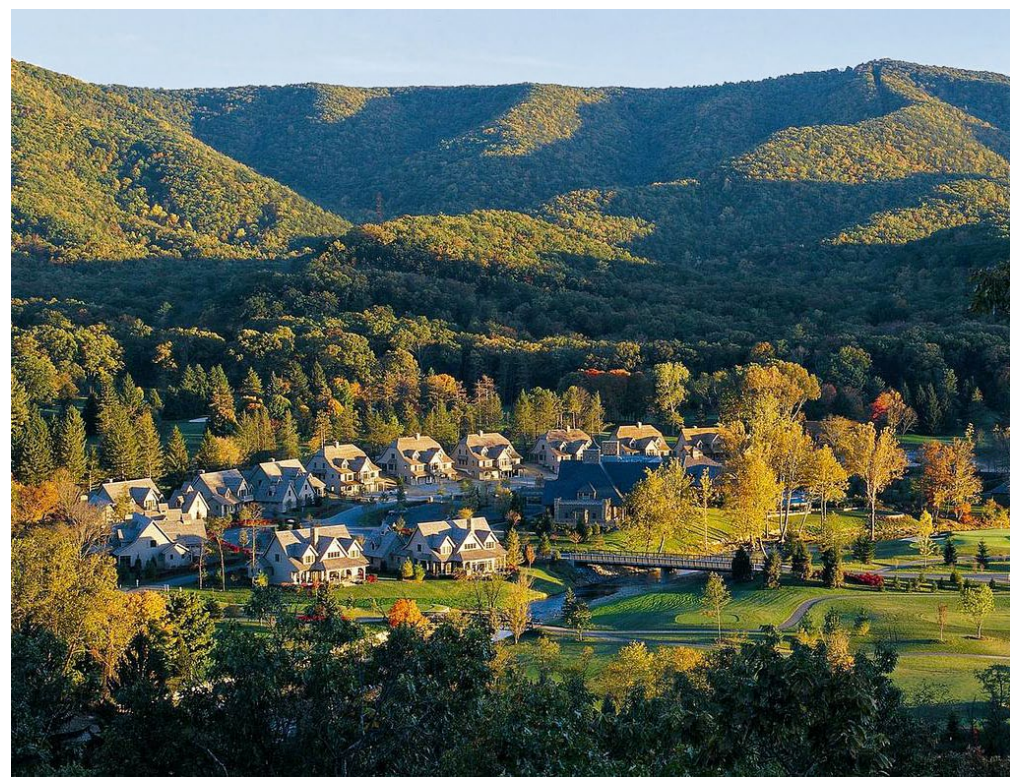
FROM TOP, CLOCKWISE: The Broadmoor, Colorado Springs, Colorado; The Greenbrier, White Sulphur Springs, West Virginia; The Cloister, Sea Island, Georgia