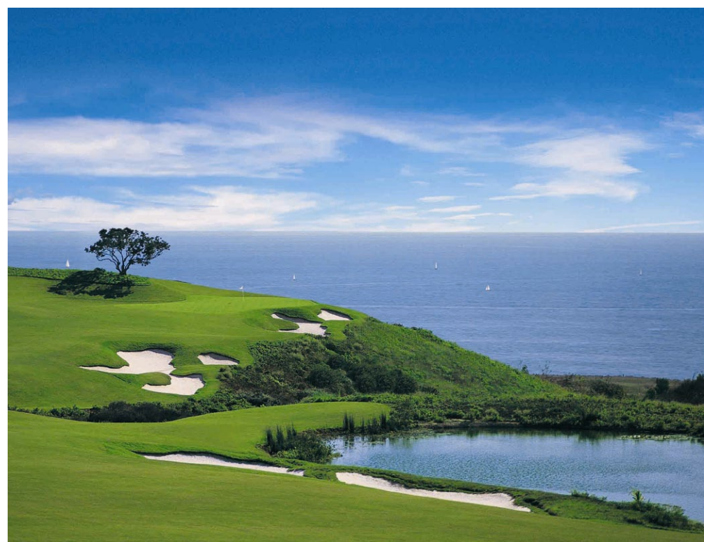
FROM TOP, CLOCKWISE: Seventh hole, Pebble Beach Golf Links at Pebble Beach Resorts, Pebble Beach, California; 17th hole, Ocean North Course at The Resort at Pelican Hill, Newport Beach, California; 11th hole, Pacific Dunes course at Bandon Dunes Golf Resort, Bandon, Oregon