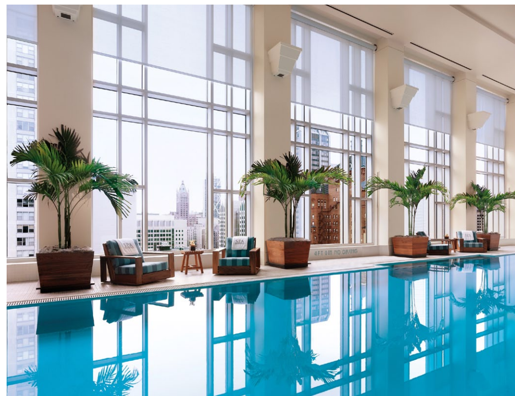
FROM TOP, CLOCKWISE: The Peninsula, Beverly Hills, California; The Peninsula, Chicago, Illinois; The Lowell, New York City, New York