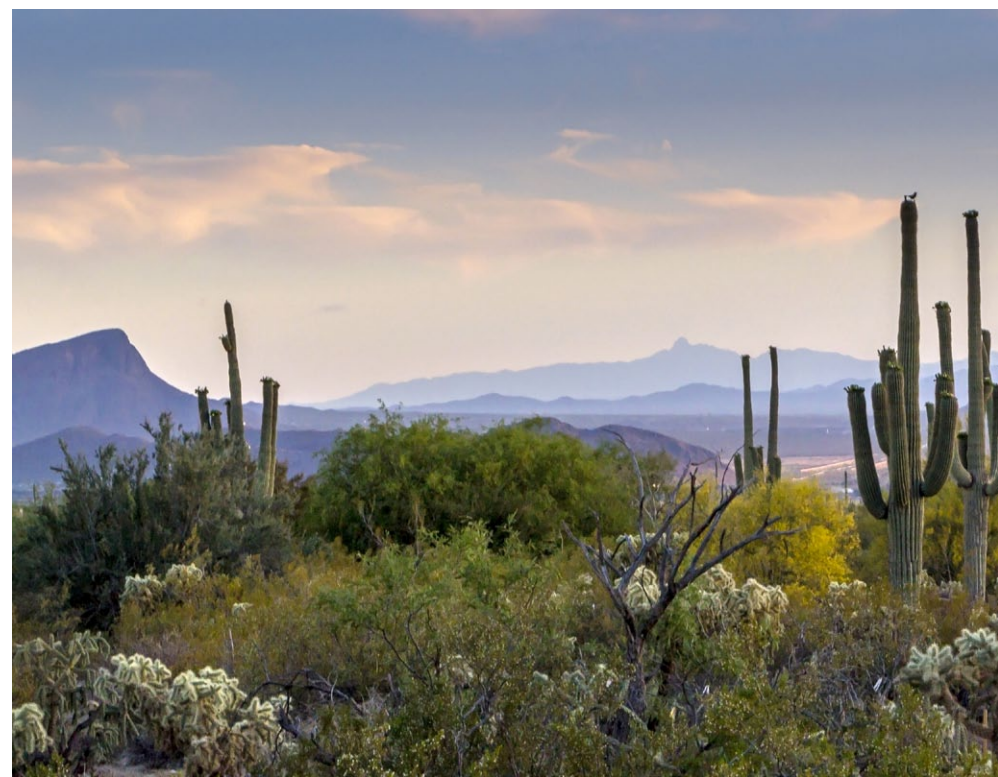
FROM TOP, CLOCKWISE: Spa outdoor relaxation deck at Miraval, Tucson, Arizona; Sonoran Desert surrounding Canyon Ranch, Tucson, Arizona; indoor pool at Canyon Ranch, Lenox, Massachusetts