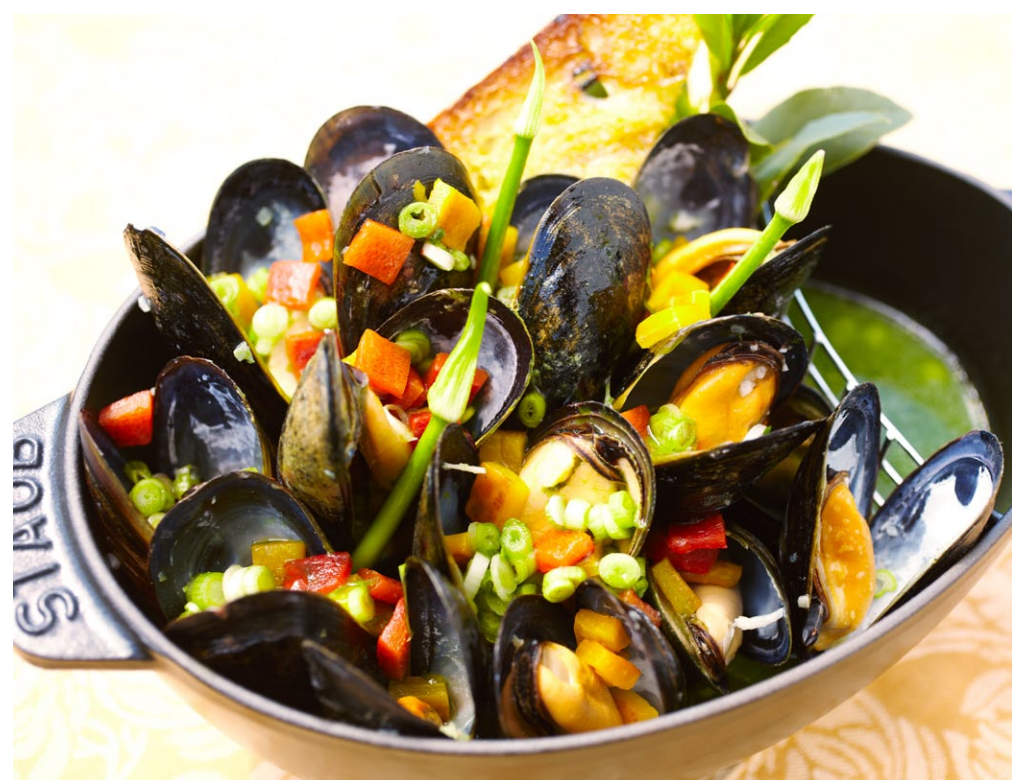
FROM TOP, CLOCKWISE: The Restaurant at Meadowood , St. Helena, California; mussels at the Restaurant at Auberge du Soleil , Rutherford, California; fall picnic tables at Blackberry Farm , Walland, Tennessee