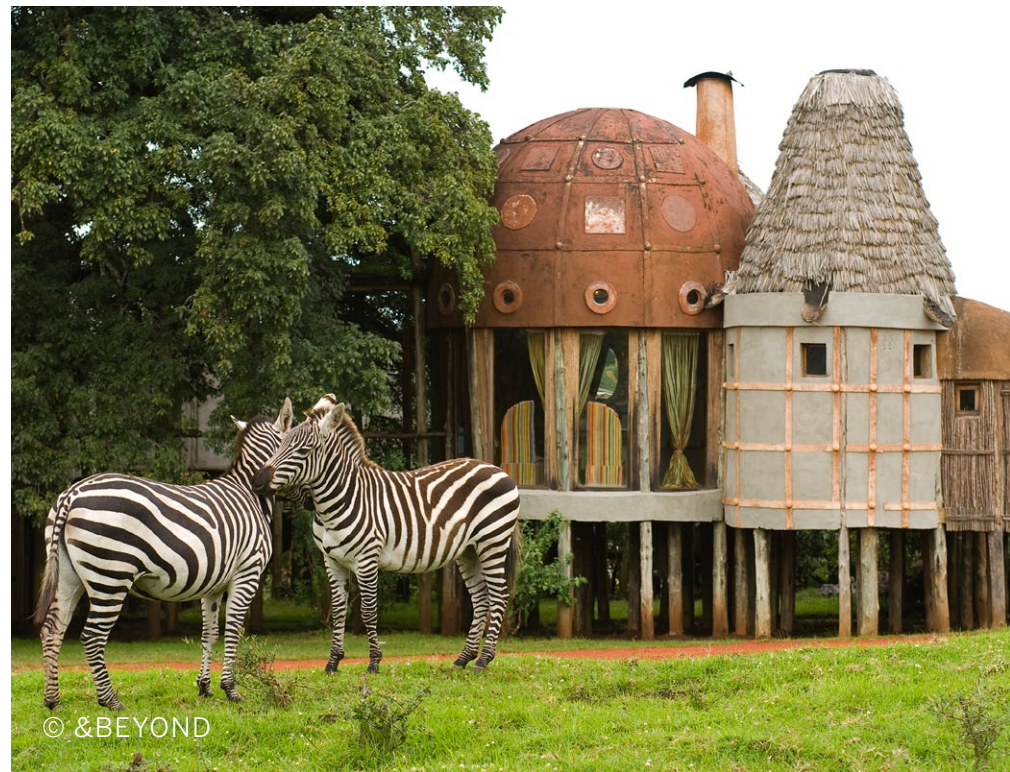
FROM TOP, CLOCKWISE: Singita Boulders Lodge, Sabi Sand Game Reserve, South Africa; Ngorongoro Crater Lodge, Ngorongoro Conservation Area, Tanzania; Mombo Camp, Okavango Delta, Botswana