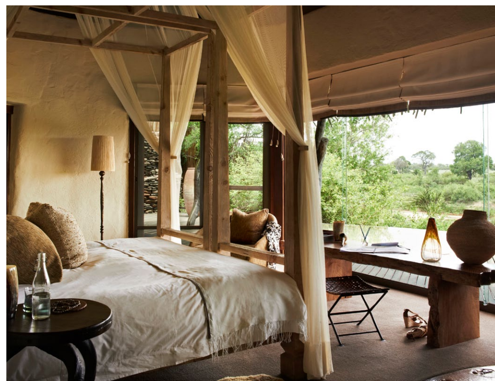
FROM TOP, CLOCKWISE: Southern Ocean Lodge, Kangaroo Island, Australia; Singita Boulders Lodge, Sabi Sand Game Reserve, South Africa; Grand Hotel à Villa Feltrinelli, Gargnano, Italy