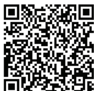
M&L HuaĀlai Playlist

Strawberries, Passion Fruit Purée, Li Hing Mui Powder, Lime, Club Soda