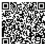
M&L HuaĀlai Playlist

Strawberries, Passion Fruit Purée, Li Hing Mui Powder, Lime, Club Soda